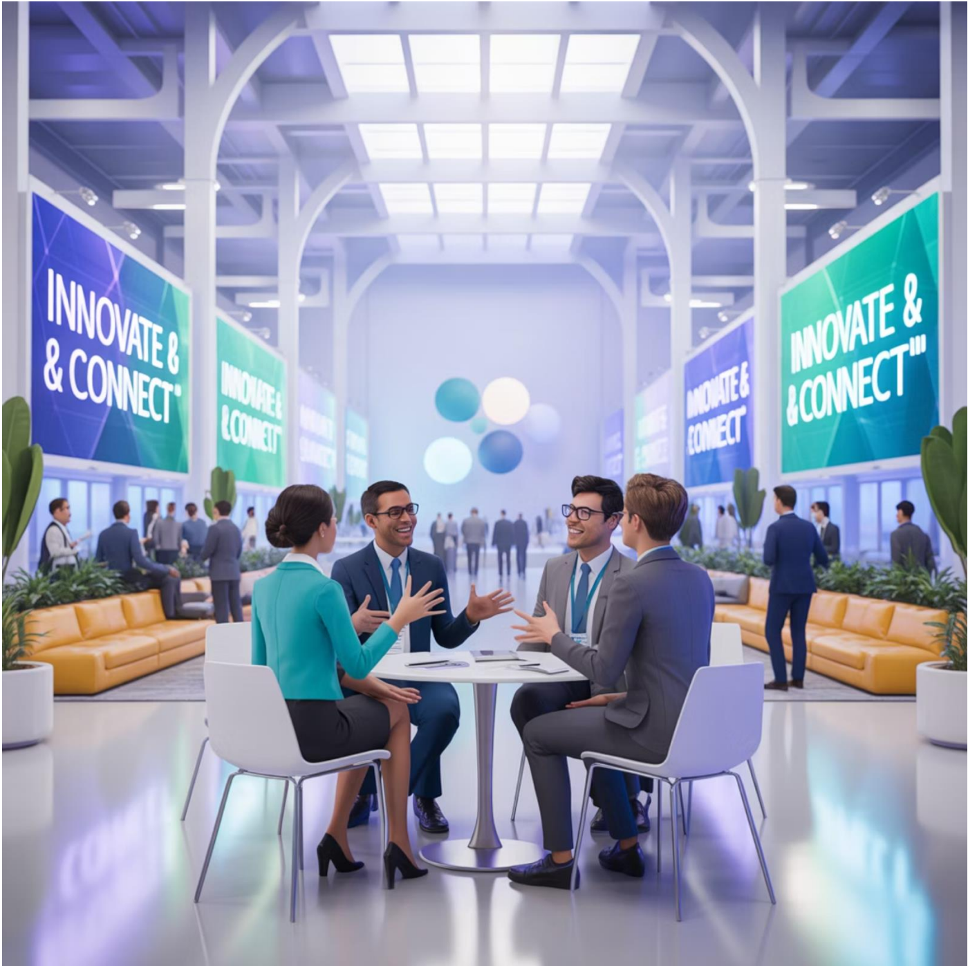
AfCFTA positions South Africa as Africa's trade gateway. Seize this moment by embracing